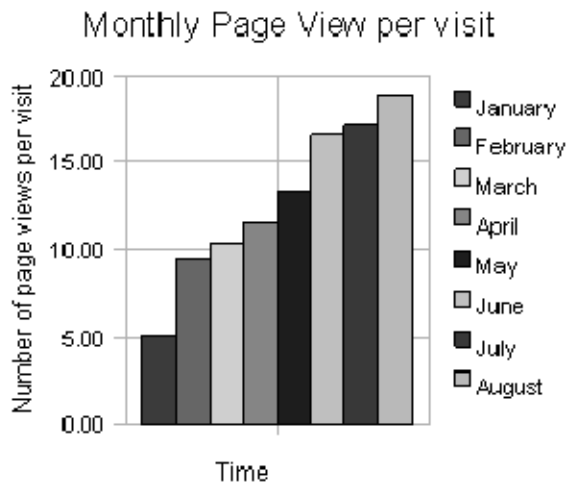
Figure 3. Usage growth per visit during project